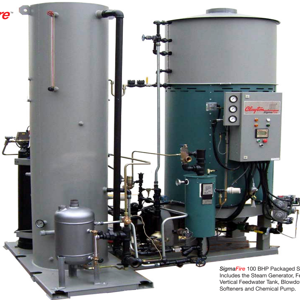
SigmaFire 100 BHP Packaged Skid. Includes the Steam Generator, Feedwater Pump, Vertical Feedwater Tank, Blowdown Tank, Water Softeners and Chemical Pump.

The unique modular design of the SigmaFire Steam Generator and ancillary feedwater components results in a system that can be easily packaged with all wiring and piping completed at the factory. The packaged system can either shipped complete or in modules that can be re-assembled on site with quick-connect fitting. Individual modules easily fit through small openings and can be reconnected as a packaged system. Clayton packaged skids reduce installation time and costs plus they ensure complete system compatibility and integrity.