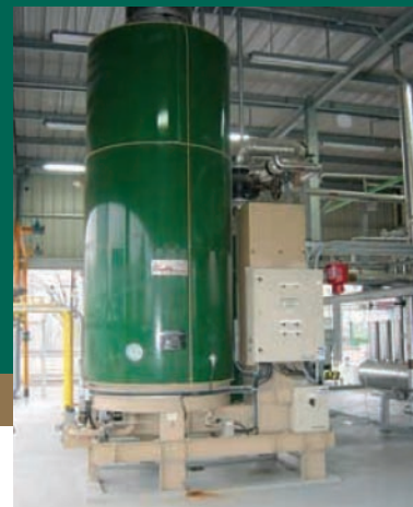
Merck depends on Clayton E-604 units.