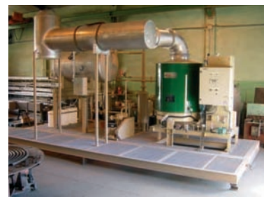
Schering-Plough has relied on Clayton for 35 years.

World Leaders in Precision Steam Generators, Fluid Heaters and Heat Recovery Systems