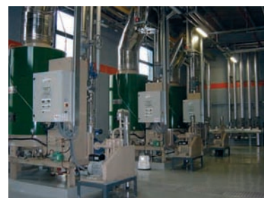
Eli Lilly uses multiple units for maximum flexibility.