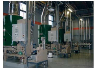
La Victoria uses multiple units for maximum flexibility in salsa production.