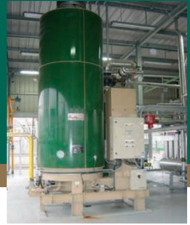
The Amurrol Division of Wrigley Co. depends on Clayton for production.