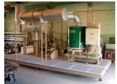
Pepsi Cola selected skid-mounted Clayton Systems for CIP.

World Leaders in Precision Steam Generators, Fluid Heaters and Heat Recovery Systems