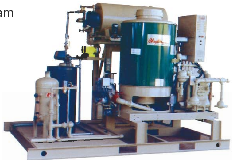
60 BHP Generator Skid with a Hotwell (Atmospheric Feedwater Receiver) System